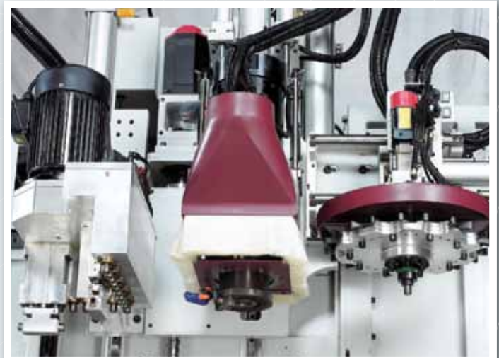
The STRATOS Series is available with multiple 32 mm system line boring units with vertical, horizontal and grooving saw options.